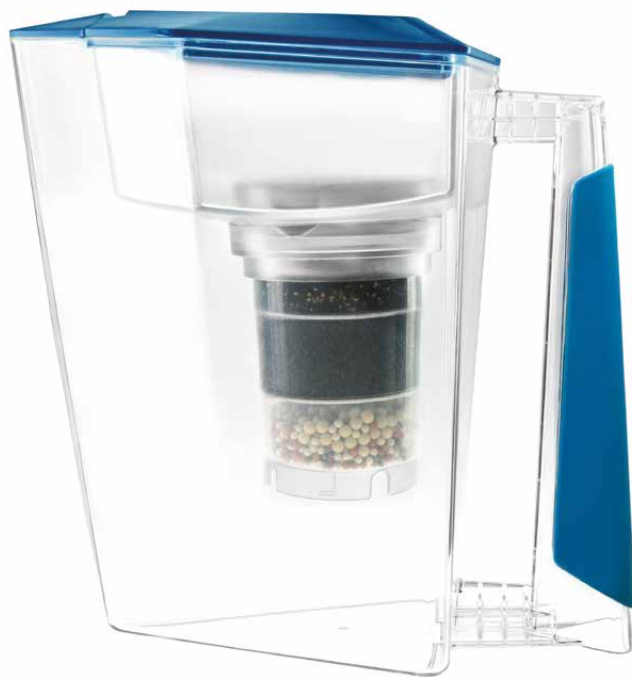
Table Water Filter System